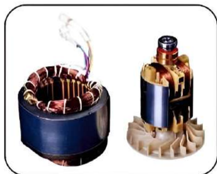
100% Copper (Insulation H Class)