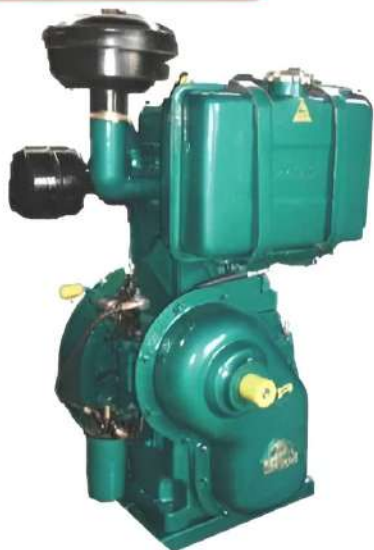
5 H.P to 14 H.P Water Cooled Engine Single Cylinder