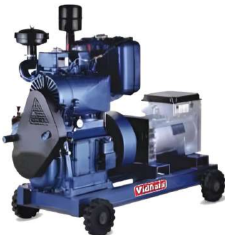
15 KVA - 20 KVA (Blower Type) Air Cooled, Double Cylinder Single / Three Phase