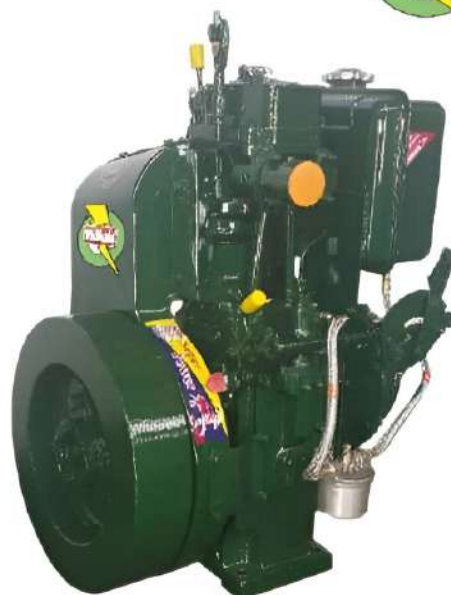
5 H.P to 12 H.P Air Cooled Engine Single Cylinder