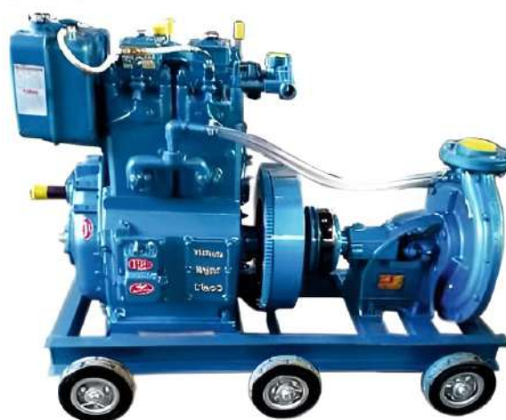
20 H.P. - 28 H.P. High Head Pumpset Water / Air Cooled, Speed 1500 RPM Pumps - Split casing type 4x4, 6x6