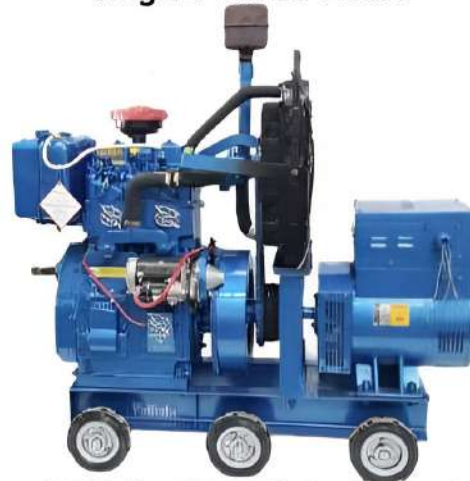
15 KVA - 20 KVA (Inductive) Water / Air Cooled, Double Cylinder Single / Three Phase