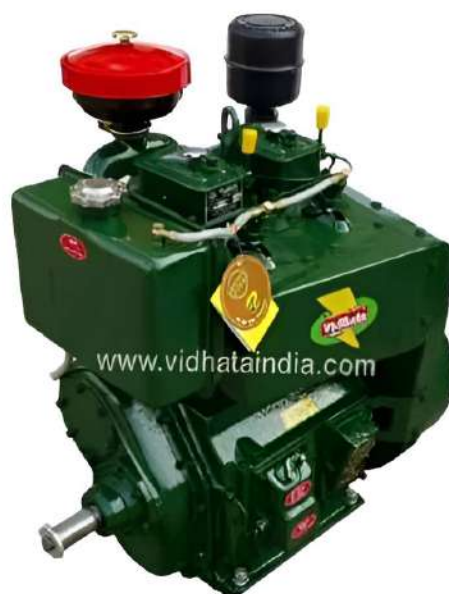
16 H.P. - 26 H.P Air Cooled Engine Double Cylinder