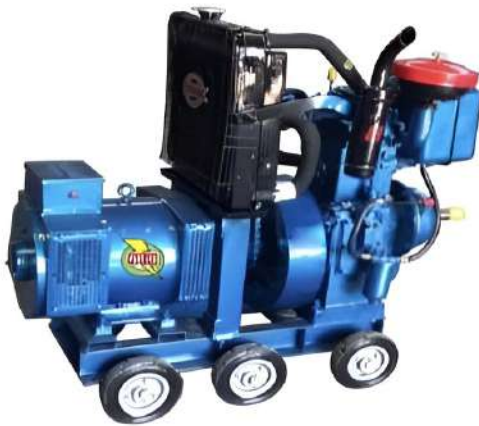
10 KVA - 12.5 KVA (Big Body) Water Cooled, Single Cylinder Single / Three Phase