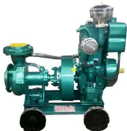
5 H.P Pumpset 80mm / 85mm Bore 3x2.5, 4x4 Gland / Oil Seal Pump Speed 1500 & 2200 R.P.M