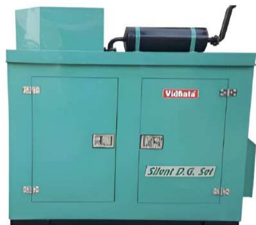
5 KVA - 20 KVA Silent D.G. Set Water / Air Cooled