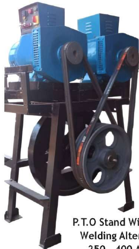
P.T.O Stand With Twin Welding Alternator 250 - 400 Amp.