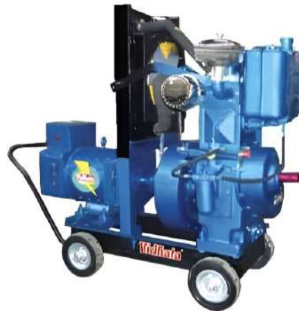
5 KVA - 9 KVA, Water / Air Cooled Single / Three Phase