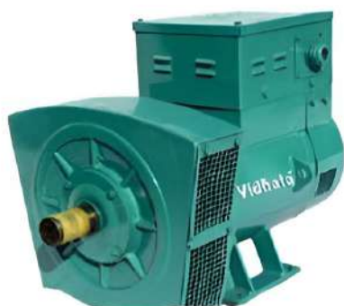
30 KVA - 35 KVA Single / Three Phase, 1500 RPM Semi Brushless Model