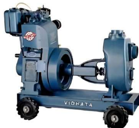
Mud Pumpset 12 H.P - 28 H.P 3x2.5, 4x4, 6x6 Pumps Speed 1500 R.P.M