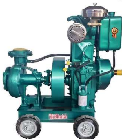
6.5 H.P. - 15 H.P. High Head Pumpset Water / Air Cooled, Speed 1500 RPM Pumps - T.R.B Oil Seal, Split casing 3x3, 4x4, 6x6