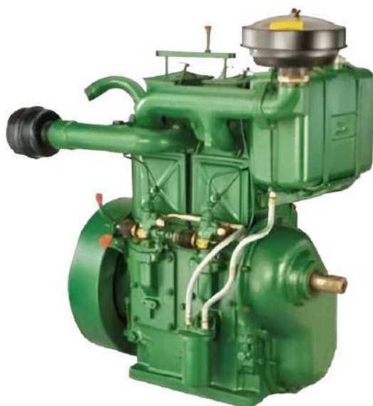
16 H.P. - 28 H.P Water Cooled Engine Double Cylinder