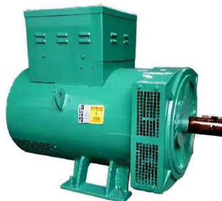
40 KVA - 100 KVA Single / Three Phase, 1500 RPM Semi Brushless Model