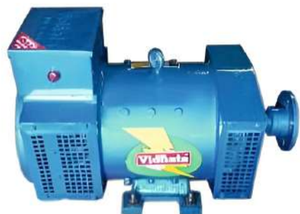
2 KVA - 9 KVA Single / Three Phase, 1500 RPM Resistive / Transformer Models