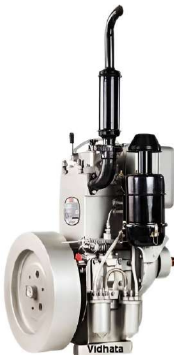
15 H.P Badshah Water Cooled Engine Variable Speed 1000 - 1500 RPM 3 Bearing System