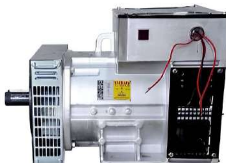
10 KVA - 25 KVA Single / Three Phase, 1500 RPM Semi Brushless Models