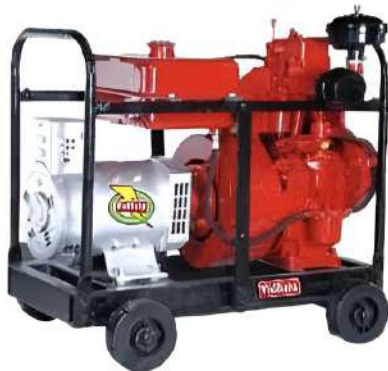
3 KVA, Water / Air Cooled Single Phase